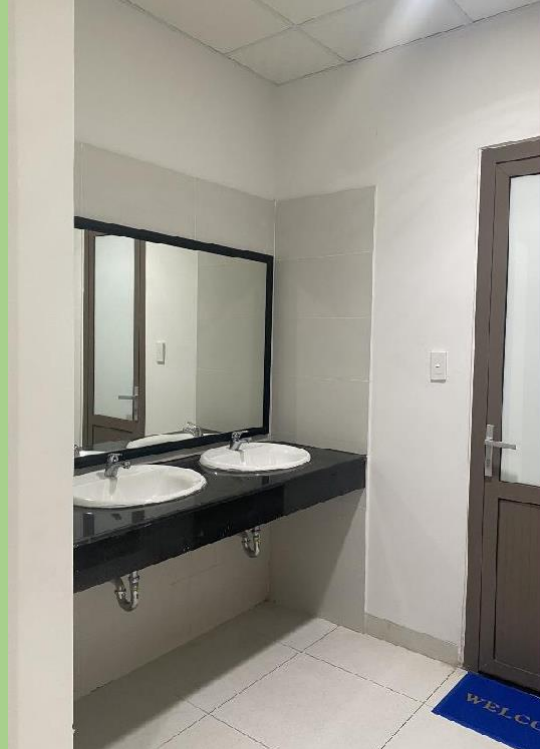
FPT University Danang Dormitory for employees