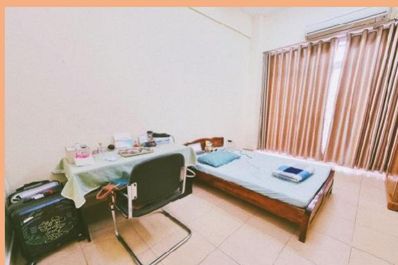
FPT University Hanoi Dormitory for employees